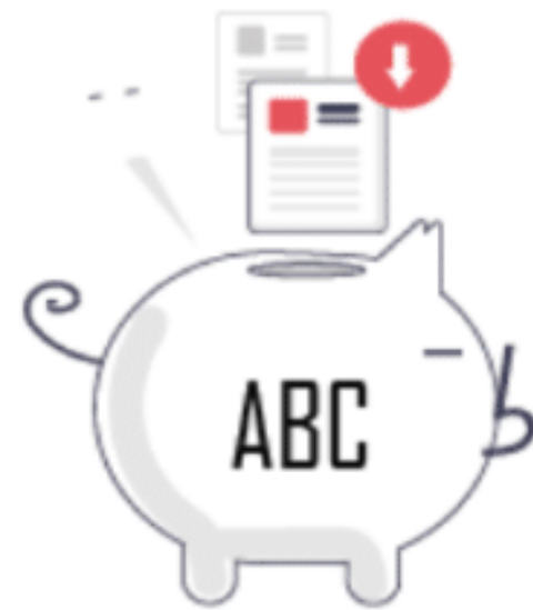
Transfer of Credits